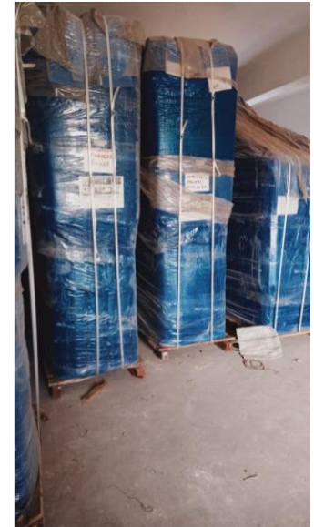
Machineries _ Intake Jetty