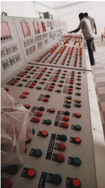
Control Panel of WTP

The Phase-I Water Supply Project under AMRUT of this municipality is almost complete. Electromechanical work of Water Treatment Plant of 124 MLD capacity nearing completion.