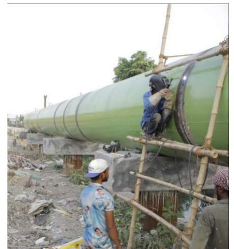
Raw Water Transmission Main Pipe Laying

Laying of 1600 mm dia DI pipe, raw water transmission main almost 70% completed from Bhut Ghat. After crossing Dumayine Avenue and Karl Marks Sarani it reaches Boat Canal, then the route is along the Boat Canal and near Chetla, it meets Tolly Naalah. After that it will be laid to Garia Mahasashan and then up to Water Treatment Plant within our Municipality. Over both the canal it is elevated. Over Dumayine Avenue, a stretch will be done by jack pushing, trenchless. Total length of raw water transmission main is 17.5 km out of which length of 1600 mm dia is 16 km, after Garia Mahasashan the diameter is 1400 mm of length 600 m. After that, 1200 mm dia pipe will enter the water treatment plant, the length is 900 m.