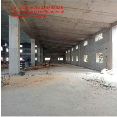
Intake Jetty – Bhut Ghat

The construction of Intake Jetty Civil work is almost 95% completed as of now. And the work of Electro-Mechanical Part is under way. The capacity of intake jetty is 185 MLD and out of the capacity, KMC will be allotted 45 MLD, Baruipur Municipality 16 MLD.