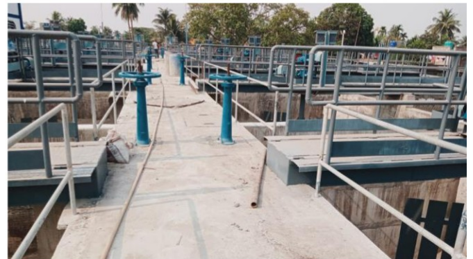
Water Treatment Plant Roof Top